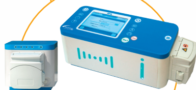
Precision dispensers PM i™ and e-pump