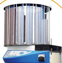
Automated Plates Filling APS One