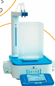
Sample diluter Dilumat®